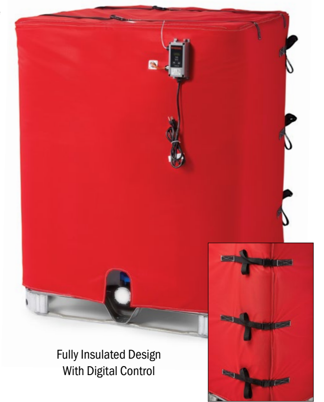
Adjustable Nylon Straps With Buckles